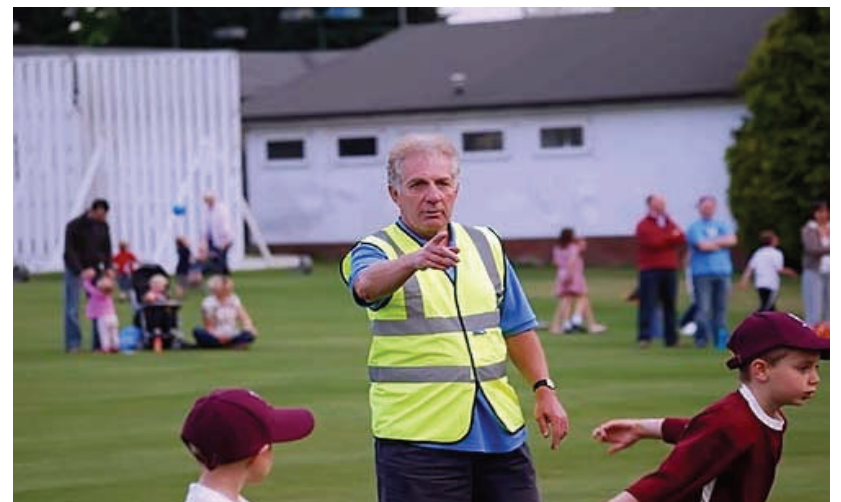
Our Oldest Colt