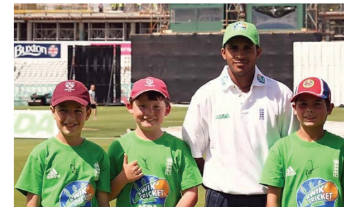
Brentwood Colts meet Adil Rashid