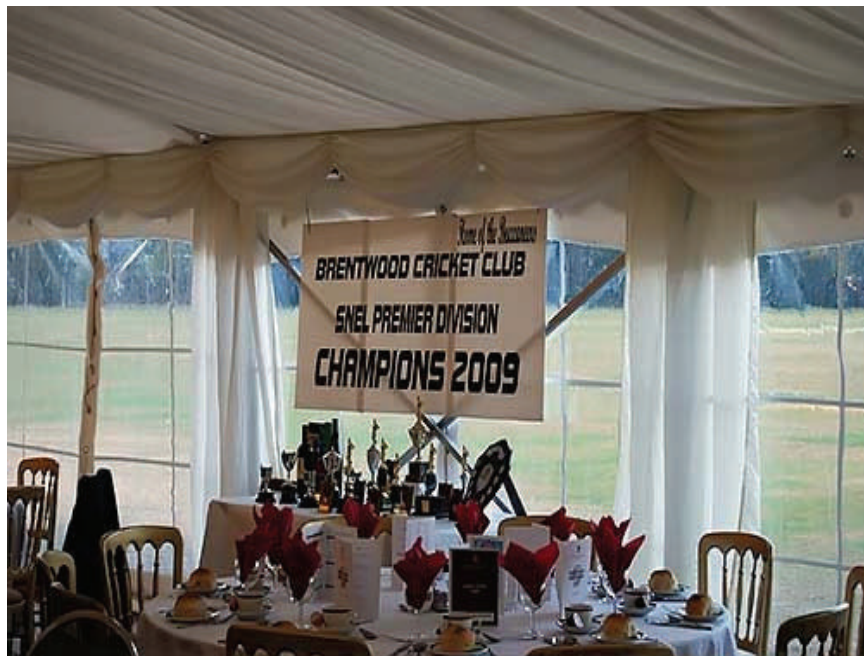
The Trophies at the Dinner Dance