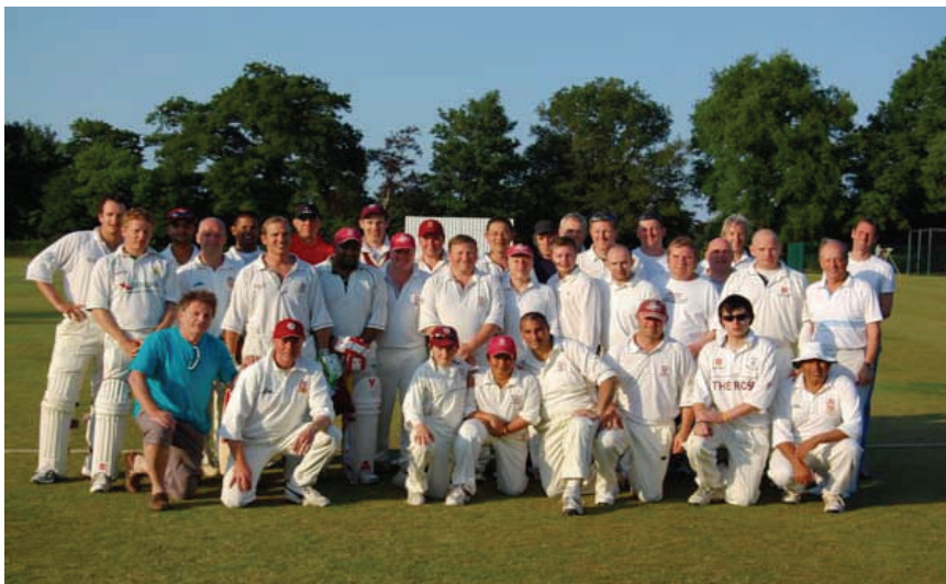
Vics v BCC Club XI Part of 20th Anniversary Celebrations